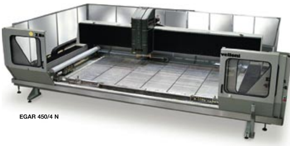
EGAR 450/4 N

For large dimensional processing & separate oversized islands