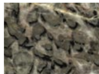
Petitor - As good as any foreign stones, the coral-rich limestones of Devon were once very popular

As more and more sediment settles to the seafloor, the grains in lower layers become compacted together,